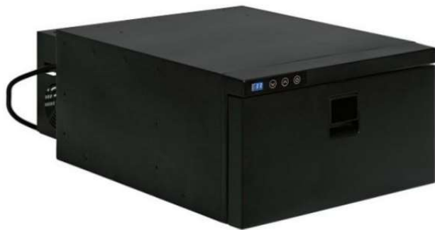
Diagram of the RaidBox®